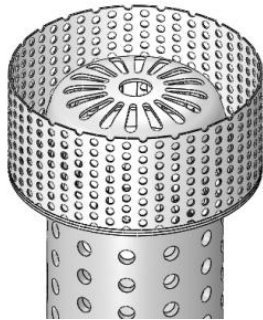
Thoát nước mặt 2 lớp (tùy chọn)