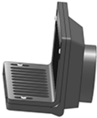
Phễu thu ngang vách Scupper Drain