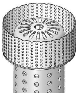
Thoát nước mặt 2 lớp (tùy chọn)